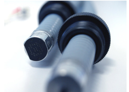
Fiber Optic Sensor