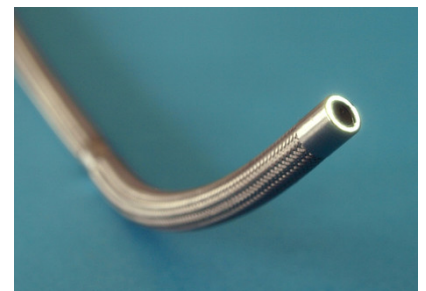
Chip on the Tip